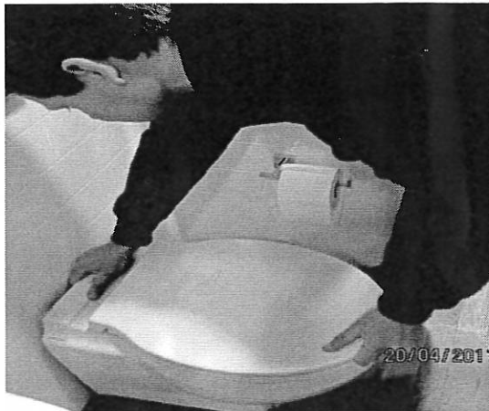
Justera mot porlinsskålen Adjust against the bowl

Fit the spike against the hole in the seat cover. Put the screw in the centre and screw tight.