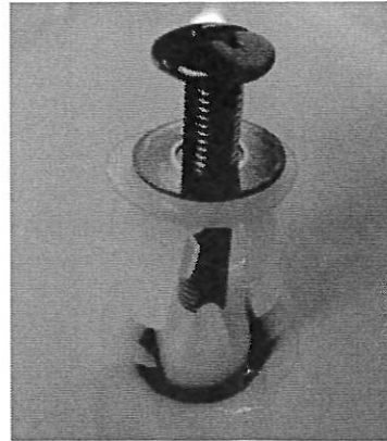
Sätt expander med skruv i hålet Put the expander with screw into the hole