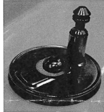
Justera in piggen mot hålen i WC locket. Centrera skruven och dra åt hårt.

Make sure the expander is all the way down. Remove the screw.